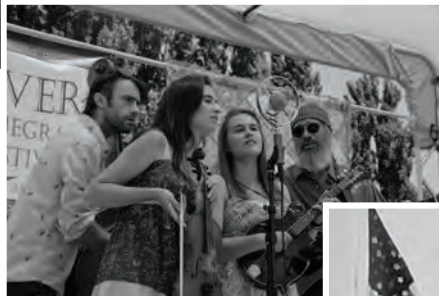
Rainy and the Rattlesnakes