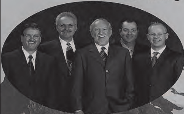
DOYLE LAWSON & QUICKSILVER

Where The Young & Old Come Together To Play