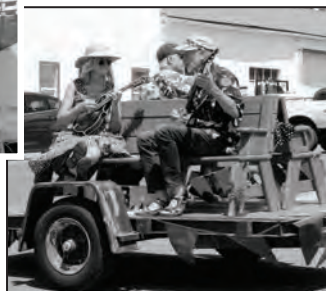
Pickers in the Fossil parade