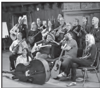
Bluegrass In The Gorge