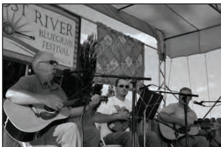
Stukel Mountain Stranglers Band