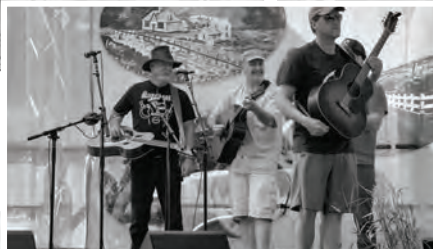
Old Growth Quartet