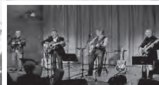
Cascade Mountain Boys