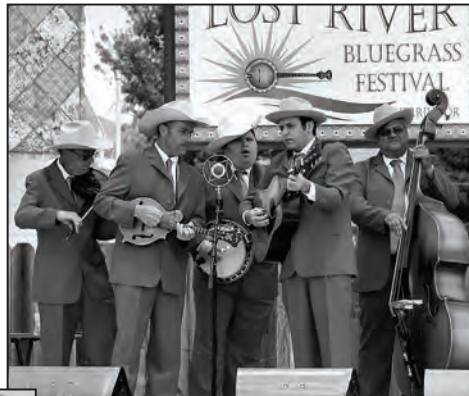
Central Valley Boys