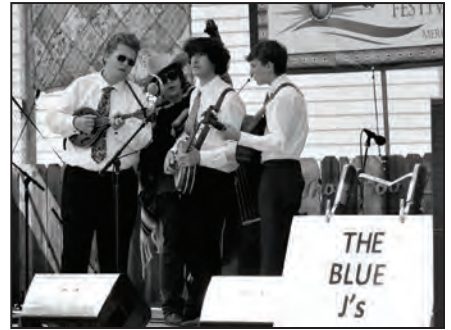
The Blue J's.