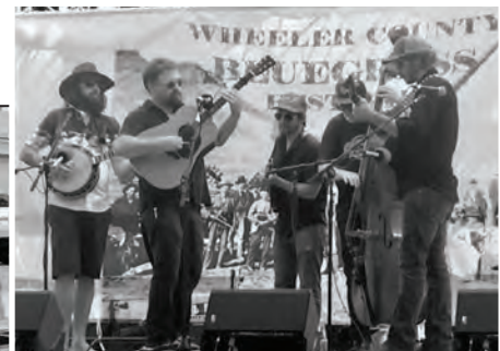
The Portland Radio Ponies