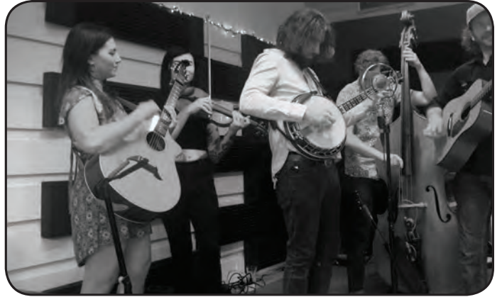
Never Come Down at Gastromania