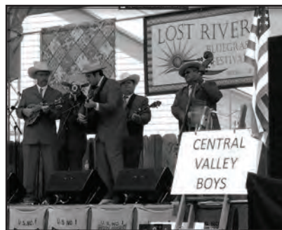
Lost River Festival