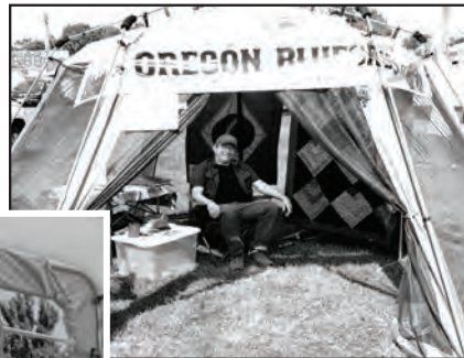
Lonely At The Top