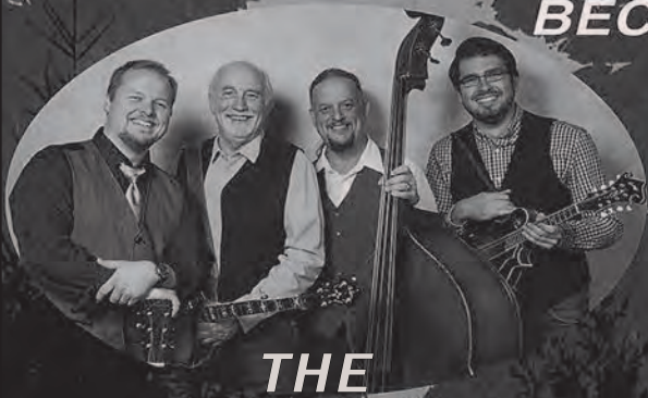
THE SPECIAL CONSENSUS